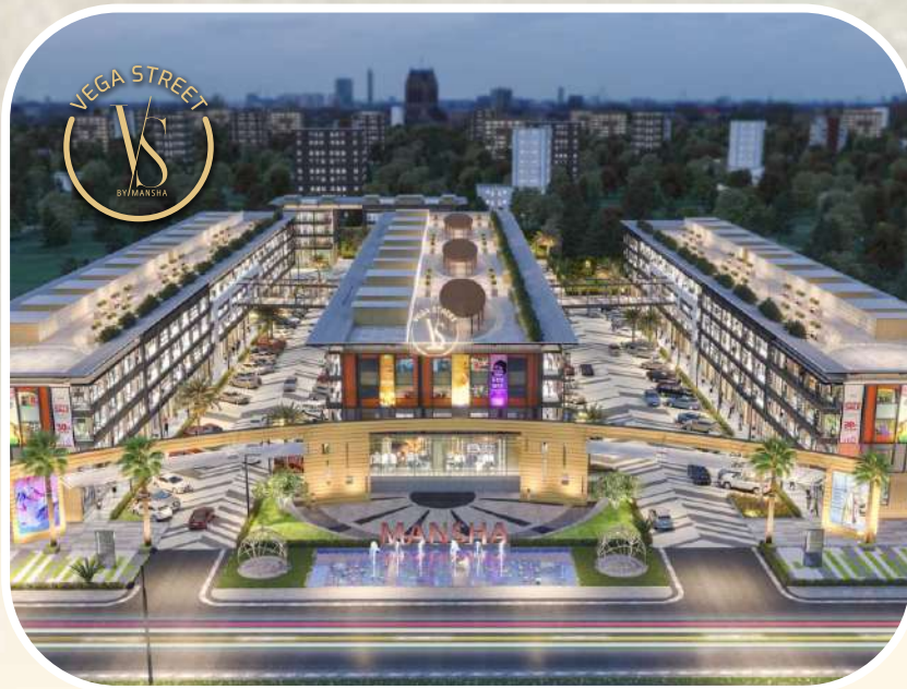
WORLD CLASS HYPER MARKET COMMERCIAL PROJECT AT SECTOR 82, FARIDABAD