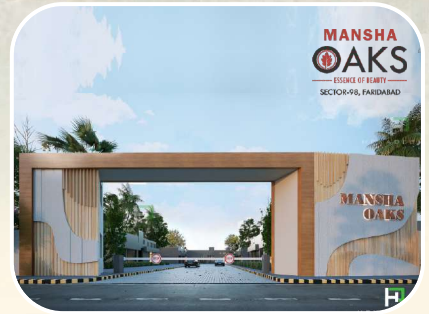
MODERN RESIDENTIAL TOWNSHIP AT SECTOR 98, FARIDABAD